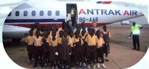
Introducing Street kids to the aviation industry.