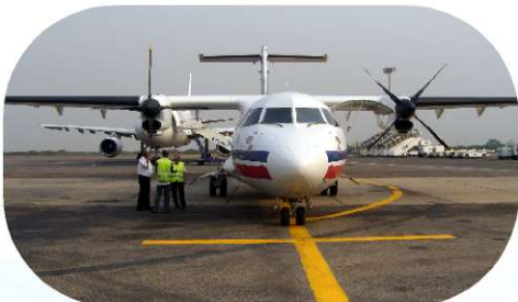
Arrival of the second ATR at KIA January 2008